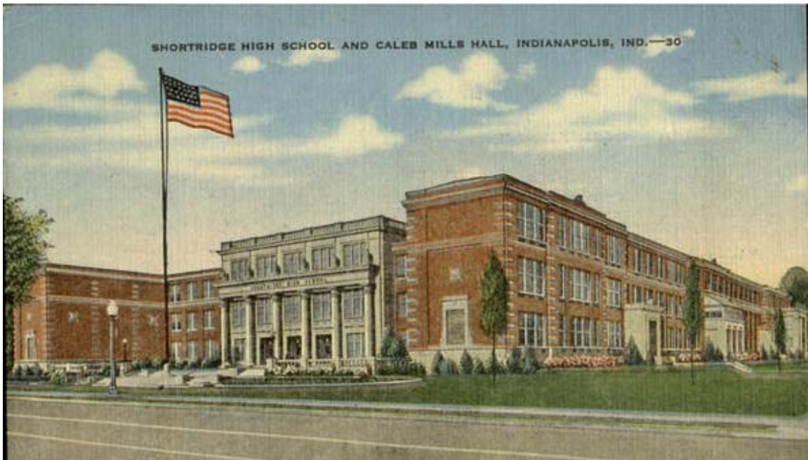
Postcard dated 1946

Shortridge High School, successor of the old Indianapolis High School located at 34 th and Meridian Streets. Enrollment 3,500 pupils, work devoted largely to preparation for college.